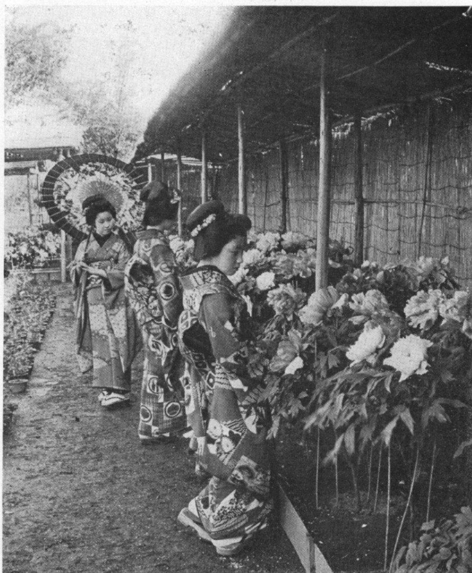
MISS BUTTERFLY IN THE GARDEN

is called), but it is always the young daughter whose willing little feet carry her back and forth in service.