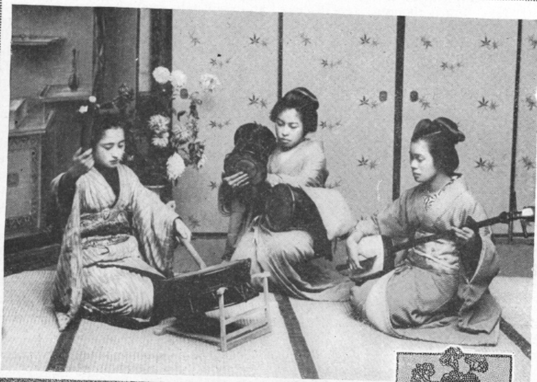
IN THE MUSIC ROOM