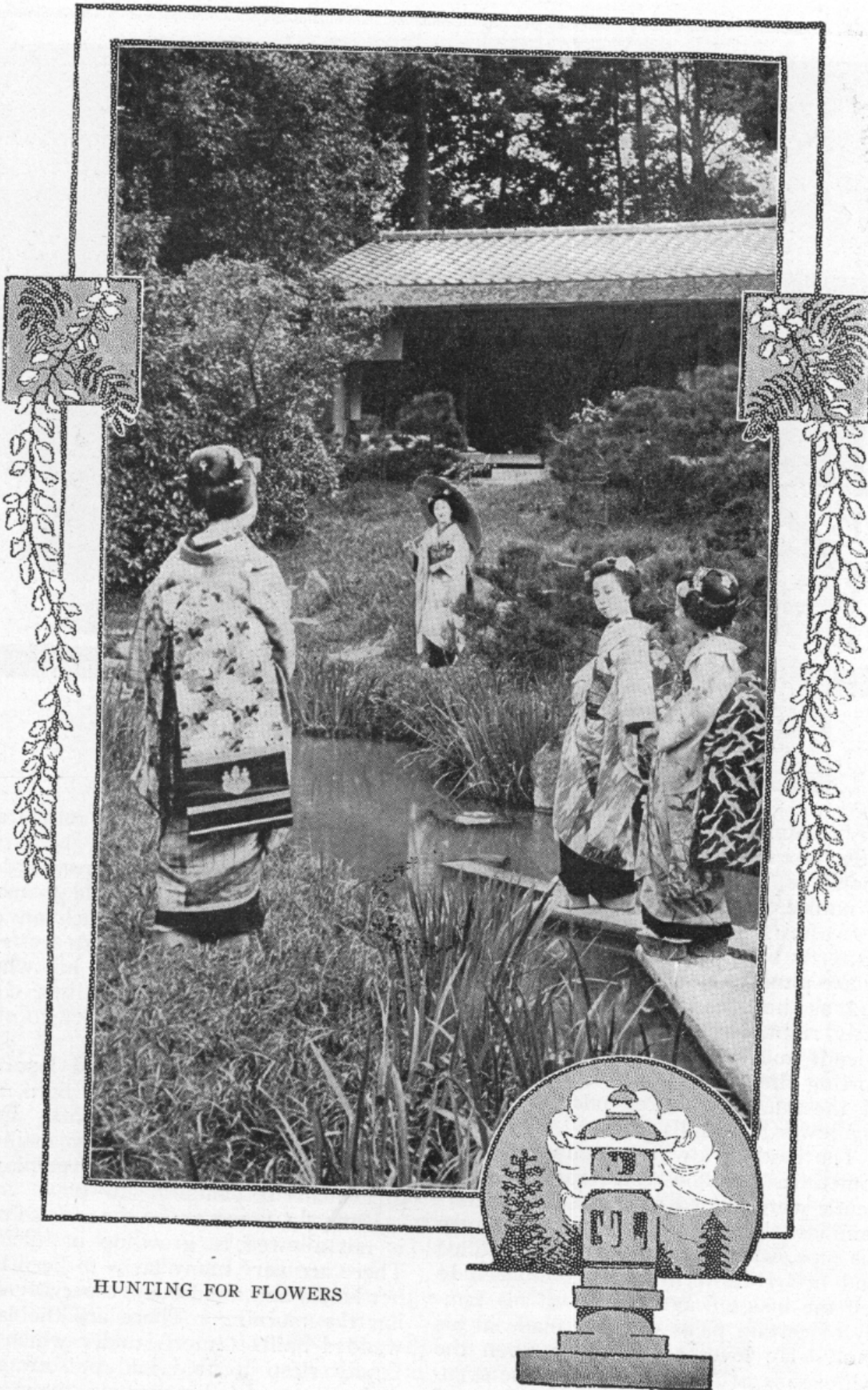
HUNTING FOR FLOWERS