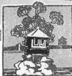
"HER LITTLE CIRCLE OF FRIENDS"

for obtaining his willing consent and often company. Chichi (papa), she knows, is, like all Japanese, an admirer of nature, and despite his weighty business affairs, at heart, a poet. So Miss Butterfly beguiles him with dreamy talk of the plum trees in the temple gardens, and, as she fixes his final cup of tea exactly right, she tells him innocently of friends and neighbors she has seen disporting themselves under the trees, and of the happy picnickers already traveling toward the hills.