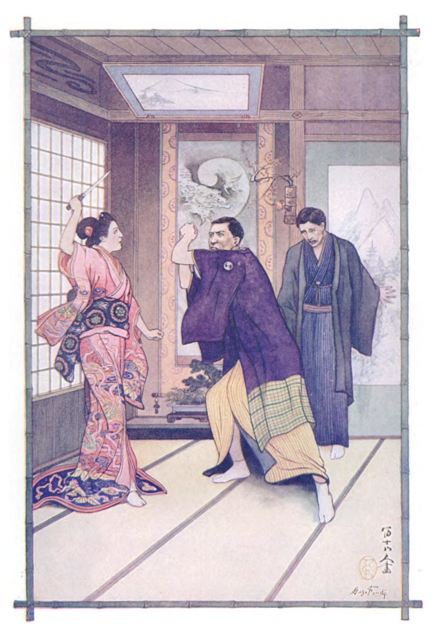
"As the sword flashed upward he dashed to one side and then slipped under its guard."