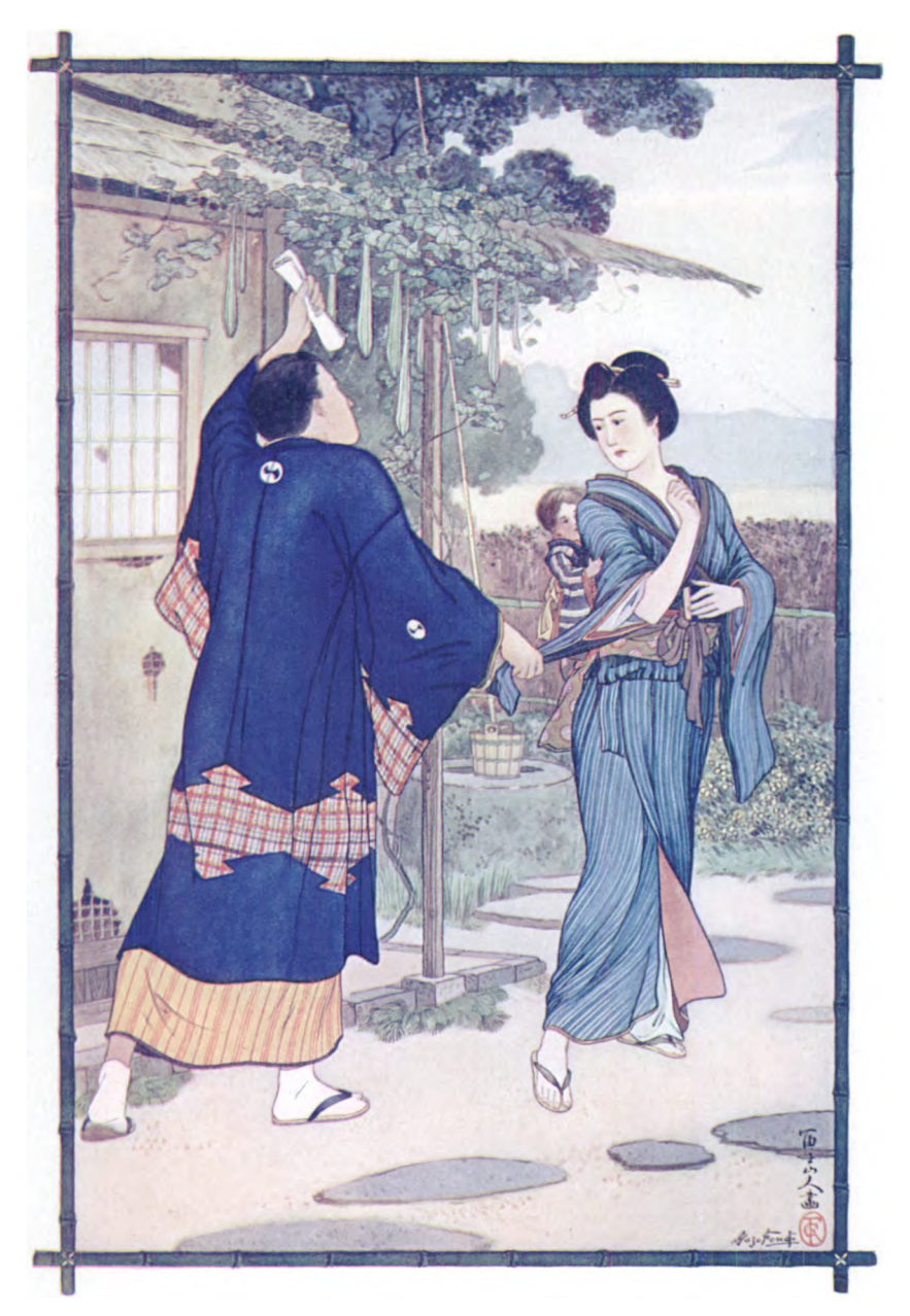
"'My house awaits your coming, and I have sworn to possess you.'"