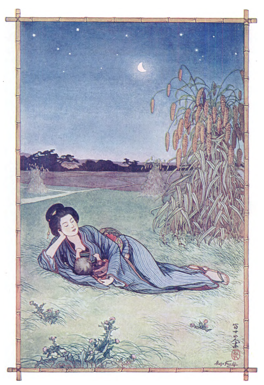
"The shadows of the night were her only covering, and the soft, mossy grass her mattress."