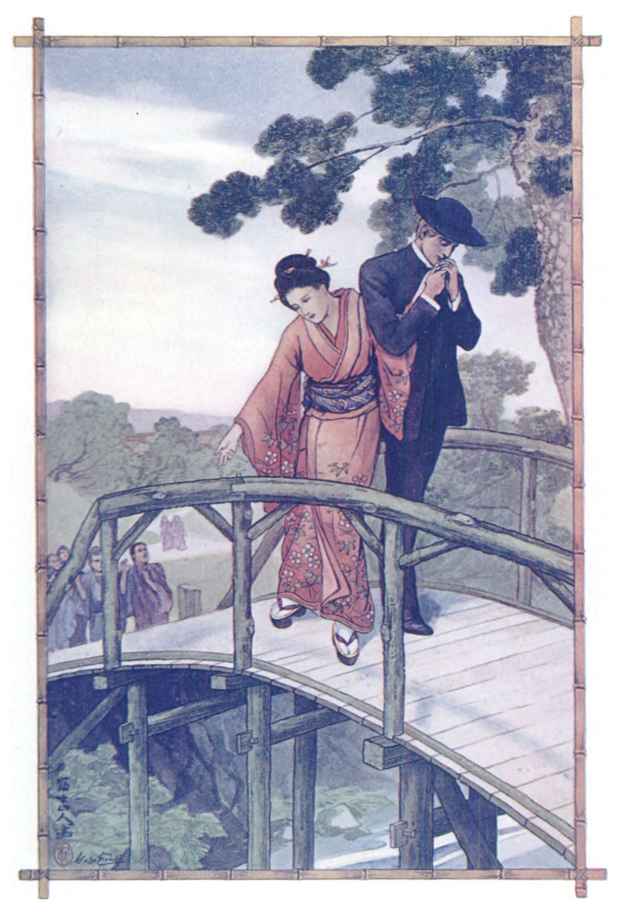
"She threw the tablets in the direction of the little river in the valley below."